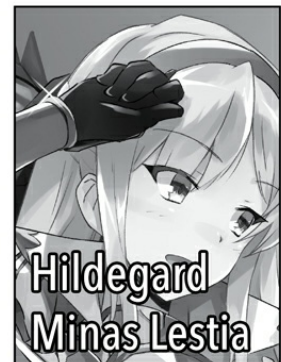
Hildegard Minas Lestia

One of Touya's fiancées. Former Clan Matriarch of the Fairies, she now serves as Brunhild's Court Magician. She claims to be six-hundred-and-twelve years old, but looks tremendously young. She can wield every magical element except Darkness, meaning her magical proficiency is that of a genius. Leen is a bit of a light-hearted bully.