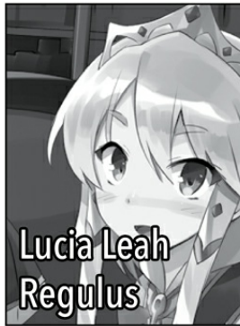
Lucia Leah Regulus

One of Touya's fiancées. She was ten years old in her initial appearance. Her nickname is Sue. The niece of Belfast's king, and Yumina's cousin. Touya saved her from being attacked on the road. She has an innocently adventurous spirit.