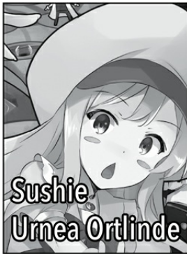
Sushie Urnea Ortlinde

A highschooler who was accidentally murdered by God. He's a no-hassle kind of guy who likes to go with the flow. He's not very good at reading the atmosphere, and typically makes rash decisions that bite him in the ass. His mana pool is limitless, he can flawlessly make use of every magical element, and he can cast any Null spell that he wants. He's currently the Grand Duke of Brunhild.