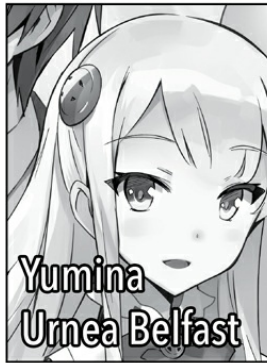
Yumina Urnea Belfast

One of Touya's fiancées. The elder of the twin sisters saved by Touya some time ago. A ferocious melee fighter, she makes use of gauntlets in combat. Her personality is fairly to-the-point and blunt. She can make use of Null fortification magic, specifically the spell [Boost] . She loves spicy foods.